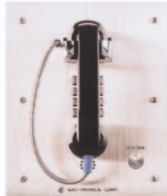
276-003 Flush Panel Phone