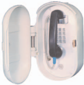
226-003 Tough Phone