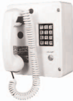
246-003 Indoor Phone