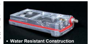
• Water Resistant Construction

Built to meet or exceed the requirements of the U.S. MIL-STD 810 C/D/E standard, the VX-210A is designed to survive under difficult operating conditions of shock and vibration. Cost-performance begins with durability, and the Mil-Spec toughness of the VX-210A is your guarantee of its design quality.